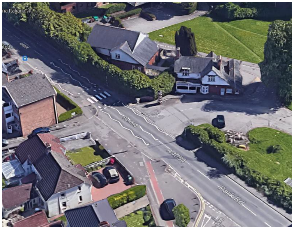
Figure 2: Site Location – Entrance Aerial View